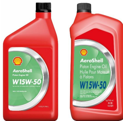
Old to New Bottle